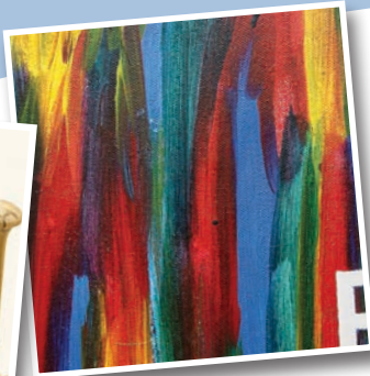
Student work from Spring Art Show.